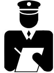
Community Safety is one of your top Priorities