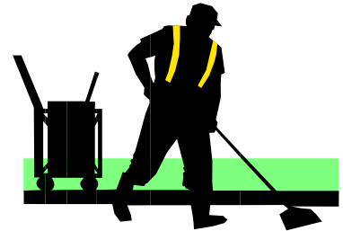
Cleaner streets—9% increase in satisfaction in 3 months

What annoys you the most is the amount of litter in the streets and the frequency of the buses.