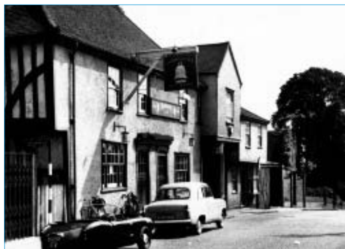
The Bell PH, Horndon-on-the-Hill

The Medieval street plan appears to have consisted primarily of High Road, which runs north-south through the village. To the west two roads lead off High Road - Mill Lane and Orsett Road on either side of the church.