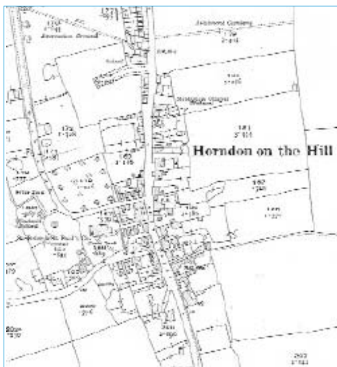
Map of Horndon-on-the-Hill (1922)

The 19th century and early 20th century saw the extension of the historic village north along High Road. However, the form of the village began to alter significantly during the 20th century with the development of land to the west of the historic village. This was initially of a sporadic nature with the sale and development of individual plots. It was only with the provision of essential services such as road access and water supply that more extensive residential development took place to fill most of the gaps that had been created.