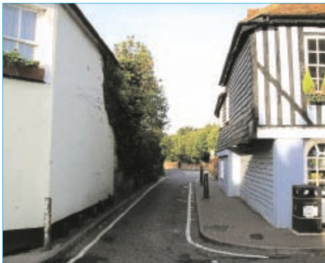
Orsett Road from junction with High Road

Orsett Road is wider in front of the churchyard. Behind a low wall and slightly set back on the south side are two pairs of 19th century brick semi-detached cottages.