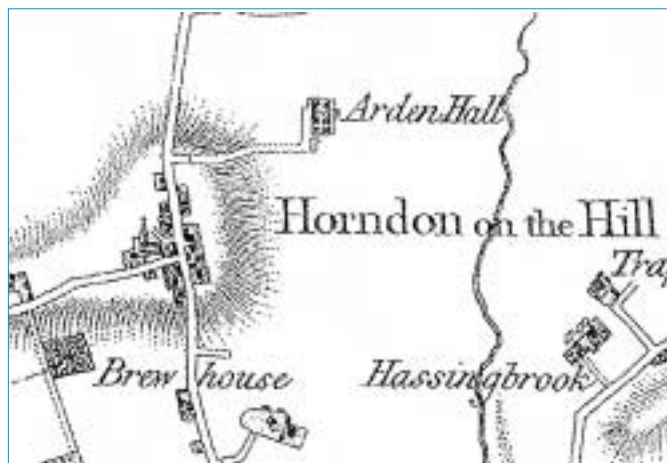
Chapman & Andre map (1777)

The alignments of two other Medieval alleyways are also discernible either side of the Woolmarket. These probably led to the area of the former market.