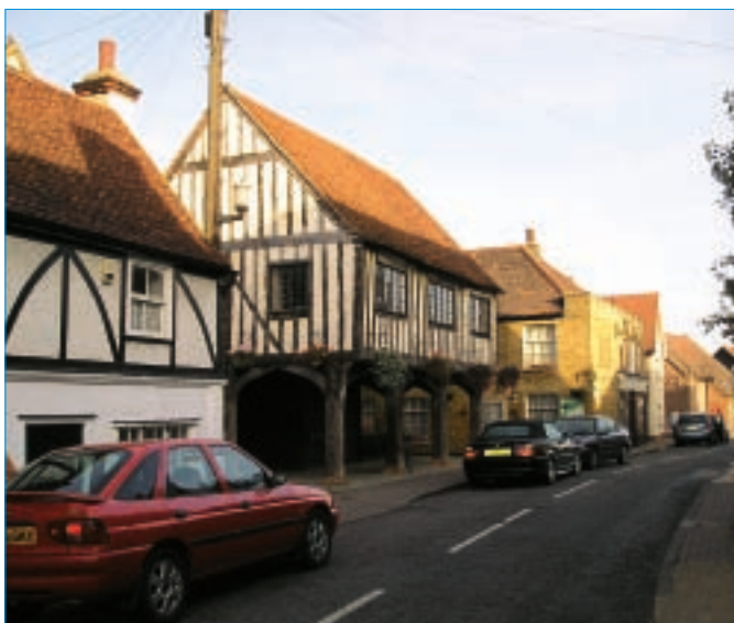
High Road –west side

High Road has a concentration of 14th, 15th and 16th century timber-frame buildings, set on the edge of the pavement. This includes the 15th century listed building (LB) The Stores (now Country Fayre), the 19th century façade to the 16th century Woolmarket Cottage (LB); and in its own space the 14th century Woolmarket (LB) (formerly the Old Market Hall). To the rear of the Woolmarket are two pairs of 19th century brick cottages, 1 to 4 The Square, which back onto a lane leading to the east side of the churchyard and framing this narrow view. There is a narrow walled passage (locally called the 'gobble shoot') at the side of the churchyard wall. Framing this on the north side is the 18th century façade of a 16th century house, Oxley House (LB), and the 19th century façade to the workshops to the rear. The prominent corner of Mill Lane has, set on the edge of the pavement, a well-proportioned 20th century development, which frames the corner.