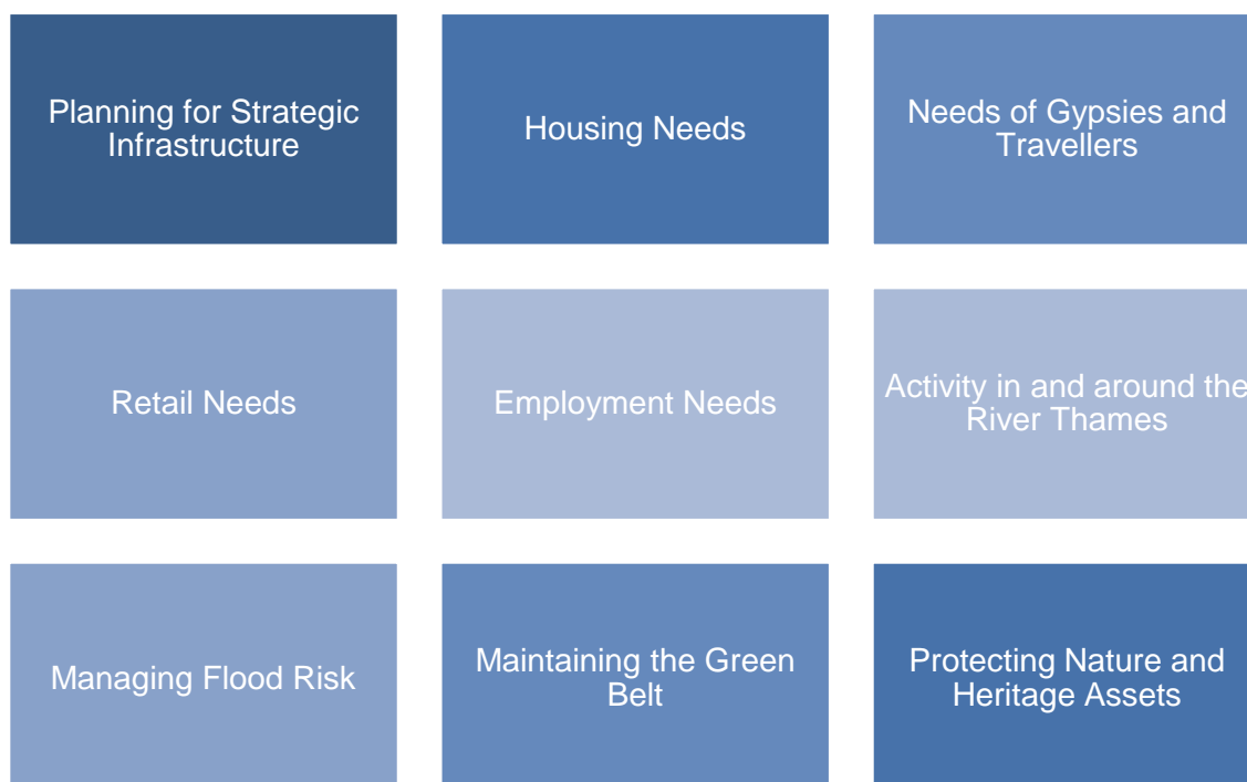
Figure 2 – Cross Boundary Issues