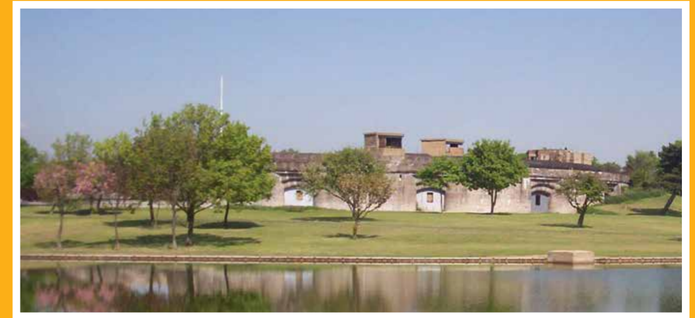
Coalhouse Fort, Tilbury