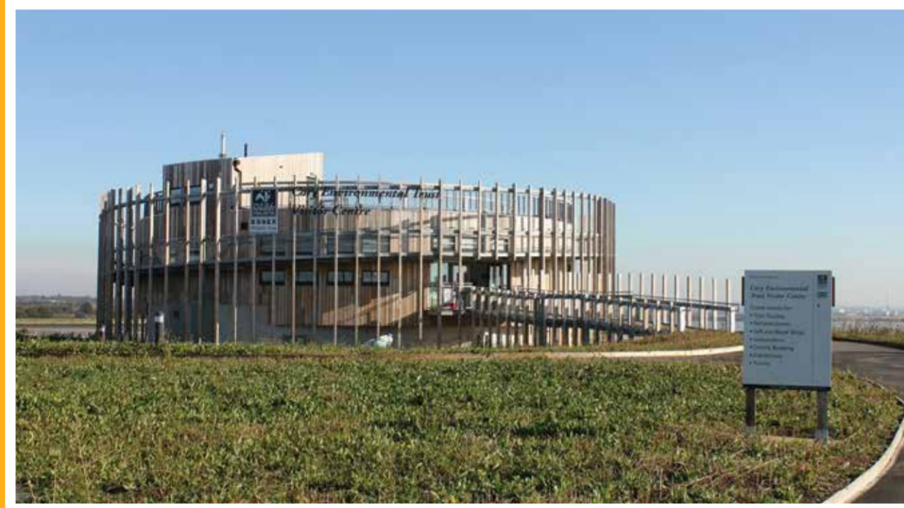
Thurrock Thameside Nature Park