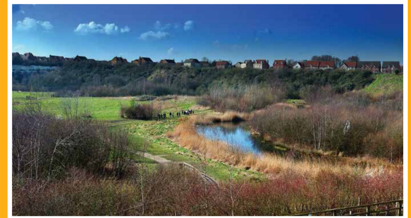
Chafford Gorges Nature Park