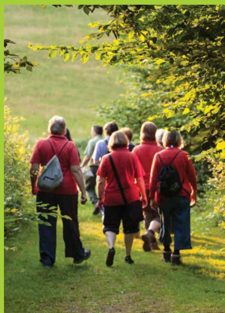
Thurrock Rights of Way Map 2014