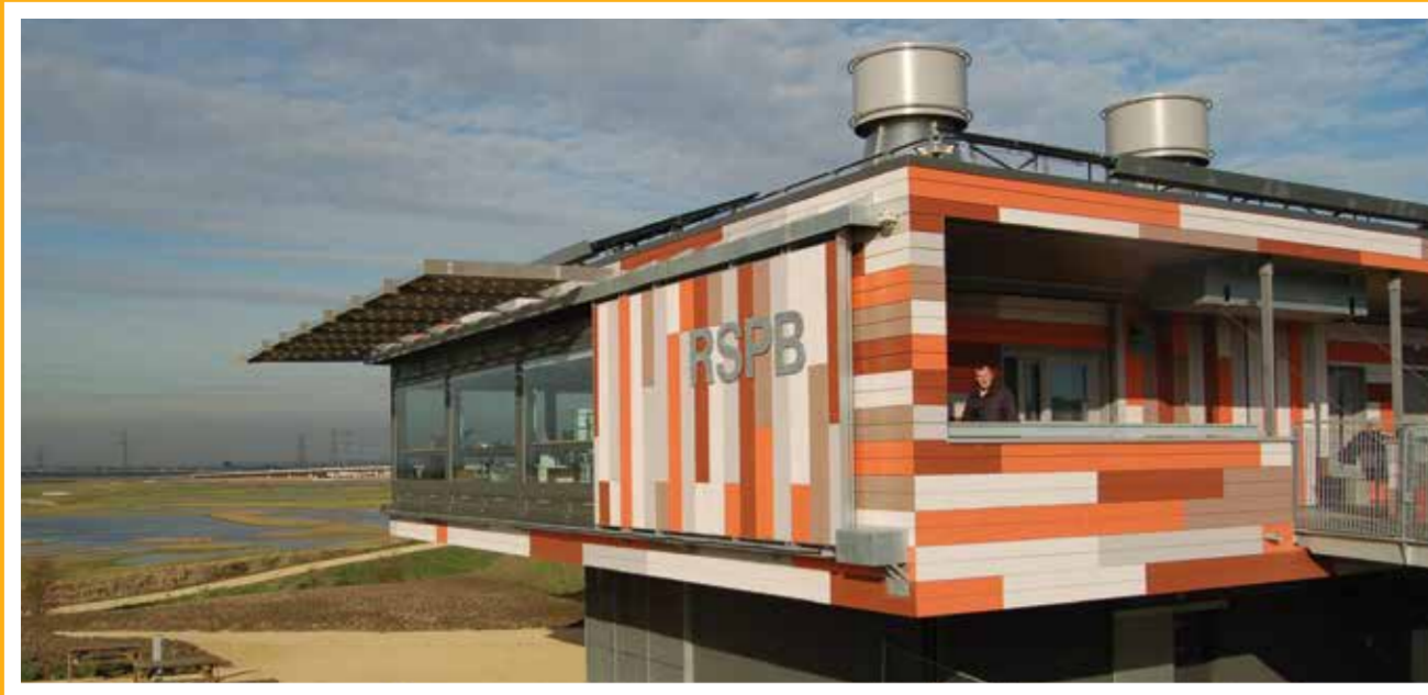
Rainham Marshes RSPB Nature Reserve